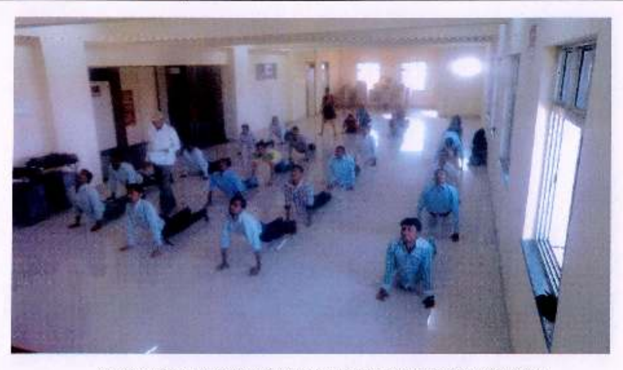
Students and staff doing the Suryanamaskar on Yoga Day (22/06/15)

Approved by AICTE, Recognized by DTE (Govt. of Maharashtra), Affiliated to Savitribai Phule Pune University