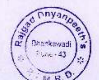
HOD & Academic Dean