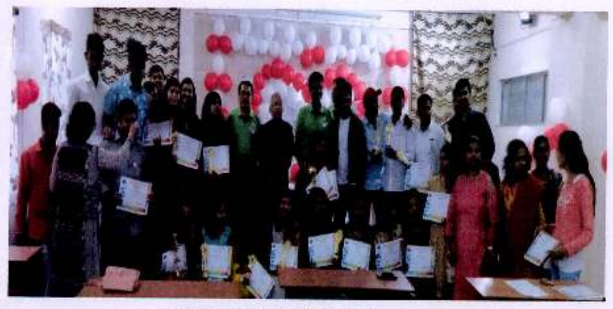
Lecture on Laughter Therapy

The institute has organized the guest lecturer on the Laughter Therapy to release physical tension and stress of students, from this session, students learn how to improve the immune system, boost mood, diminishes pain, and protects you from the damaging effects of stress.