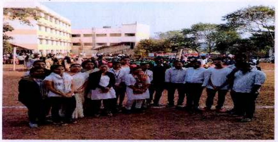
Teachers and Students celebrate the Republic Day (26/01/18)

Republic Day is a remarkable day in the history of India as the day when finally the Constitution of India came into effect on January 26, 1950. The Institute celebrates Republic Day every year on 26<sup>th</sup> Jan along with staff members, students. The day is celebrated to remember the contribution of freedom fighters in freedom wars and to show gratitude towards them. It encourages national pride and inspires everybody to contribute in their way towards national development.